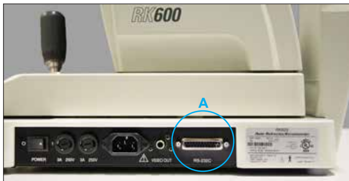
RK600 w/ serial port shown

The RK600 Auto Refractor/Keratometer uses the Extension Cable configuration to connect to the Wireless Dongle Kit. The serial port ( A ) on the side of the RK600 is where the Wireless Dongle will connect.