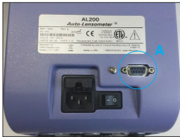
AL200 w/ serial port shown

The AL200 Auto Lensometer® can use either the Adapter Set or the Extension Cable configuration to connect to the Wireless Dongle Kit. The serial port ( A ) on the rear of the AL200 is where the Wireless Dongle will connect. In both configurations the Wireless Dongle will need to be powered by the AC-Power Supply.