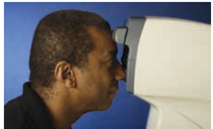
Proper patient alignment (chin close to unit)