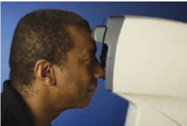
Proper patient alignment (chin close to unit)