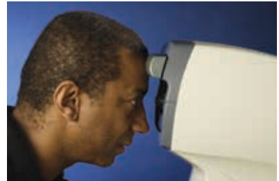
Improper patient alignment (chin moved away from unit)

Note: If the instrument is unable to complete its alignment and measurement process, it may be necessary to: