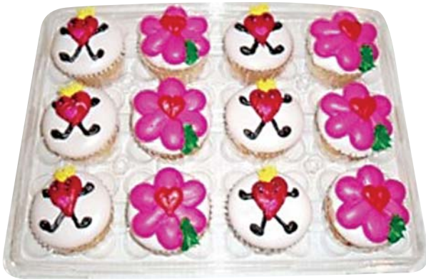
Valentine Hearts & Flowers Cupcakes

St. Valentine's Day (February 14) is traditionally a day to express love for someone, typically through love notes, or valentines. The idea of "giving your heart to the one you love" dates back to the high middle ages. Professing your love through gifts, such as flowers and chocolates, dates back to the 18th century. These days