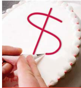
Part 5 of 5: Pricing

Now you can evaluate your total program in terms of dollar sales and