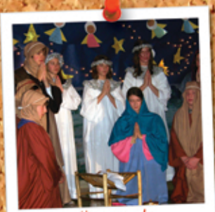
8 th Grade Christmas Program