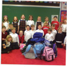
Backpacks of Supplies for Haiti