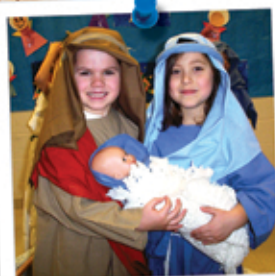
1 st Grade Paegent