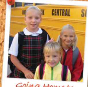
Going Home to Mom & Dad!