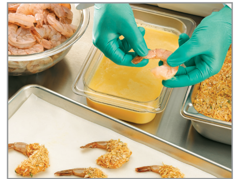
Our durable, disposable gloves assure enhanced protection for medium-duty, back-of-the-house applications and are ideal for food preparation and processing tasks like slicing, chopping and peeling.