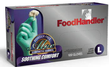
100 gloves per box

CAUTION: Components used in making these gloves may cause allergic reactions in some users. Follow your institution's policies for use.