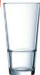
11 ¾ Oz. Hi Ball