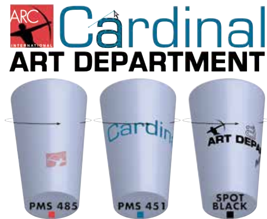
Artwork is separated into individual colors by our artists in preparation for being printed onto your glass

To find out how simple and easy the process can be, contact your Cardinal representative or send an email to: cardinalsales@arc-intl.com .