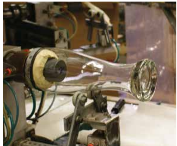
Cardinal's precision equipment is meticulously calibrated to ensure quality output on every production run.