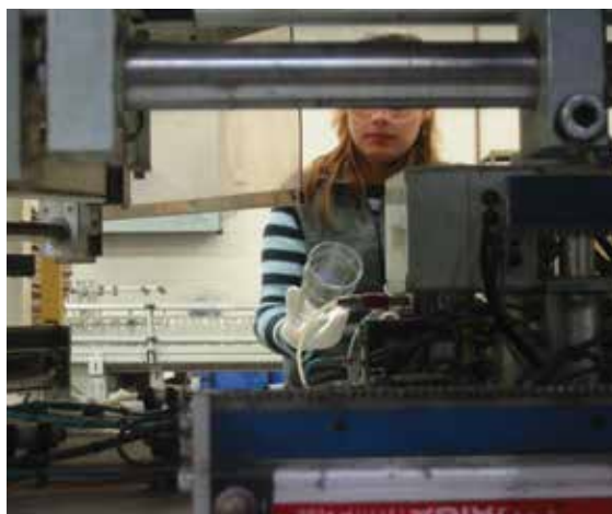
Every piece is inspected for quality.