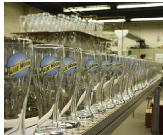
We are equipped to mass produce large orders with our fully automated machines. Glasses ride along the belt to be automatically loaded into the oven for firing.