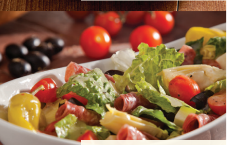
ANTIPASTO SALAD with Lido Italian Dressing Mix