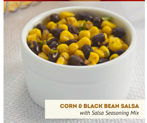
CORN & BLACK BEAN SALSA with Salsa Seasoning Mix