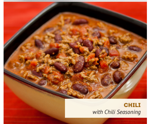
CHILI with Chili Seasoning