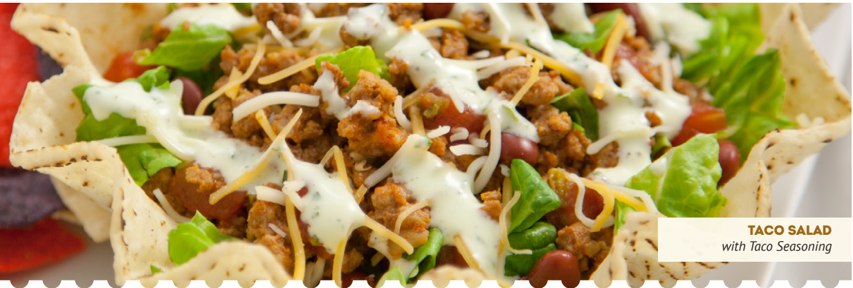
TACO SALAD with Taco Seasoning