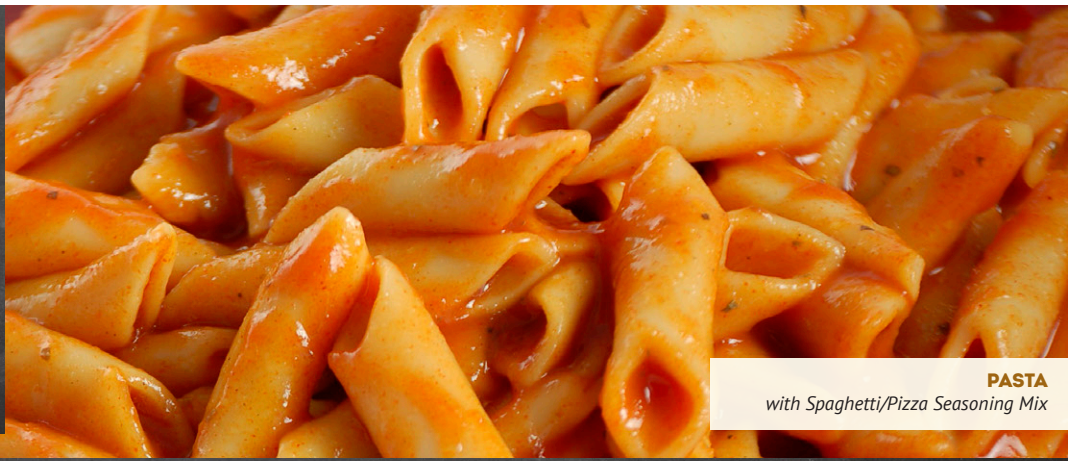
PASTA with Spaghetti/Pizza Seasoning Mix