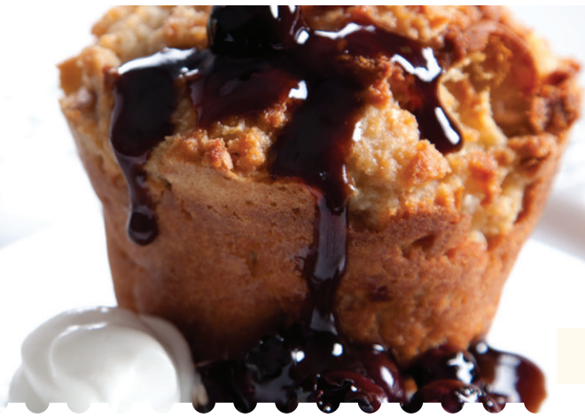
BLUEBERRY WHIP BREAD PUDDING