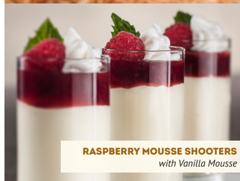
RASPBERRY MOUSSE SHOOTERS with Vanilla Mousse