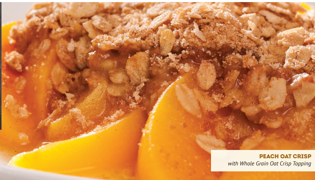
PEACH OAT CRISP with Whole Grain Oat Crisp Topping