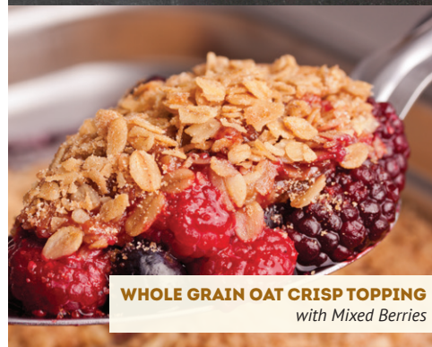
WHOLE GRAIN OAT CRISP TOPPING with Mixed Berries