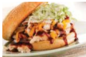
BBQ Chicken Sandwich