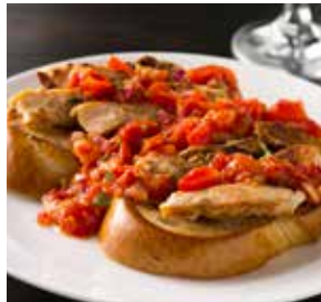
Chicken Bruschetta Sandwich

Thick Cut BreakAway products are the perfect ingredient for a variety of menus and dayparts. These products have the same great flavor and premium quality as the Original BreakAway products, but have a better bite and greater visual appeal for recipes requiring thick cut, high quality beef and chicken. Due to the thicker slices, cooking time will be longer.