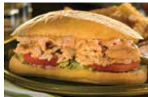
Buffalo Chicken Sandwich