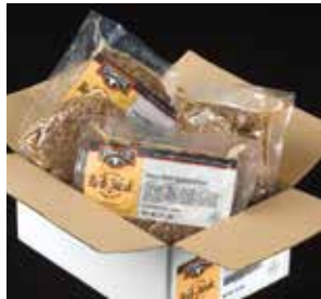
Fully Cooked Redi-Steak Package

Steak-EZE ® Fully Cooked Redi-Steak Beef Philly Slices combine the safety and convenience of fully cooked products with the delicious flavor of traditional Philly Steaks. Packaged in easy-to-handle bags, Steak-EZE Redi-Steak products are simple and cost-efficient to prepare. For the operator who may not have a flat grill or a vent, Redi-Steak products can be heated in a microwave, steamer, conventional or convection oven or by boiling in the bag on the stove top.