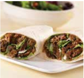
Steak Ceasar Wrap