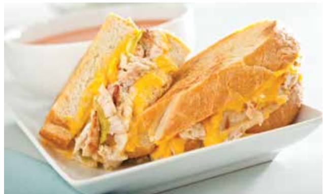
Chicken Grilled Cheese Sandwich