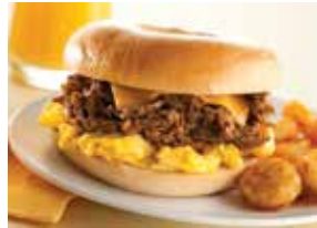
Steak, Egg and Cheese Bagel