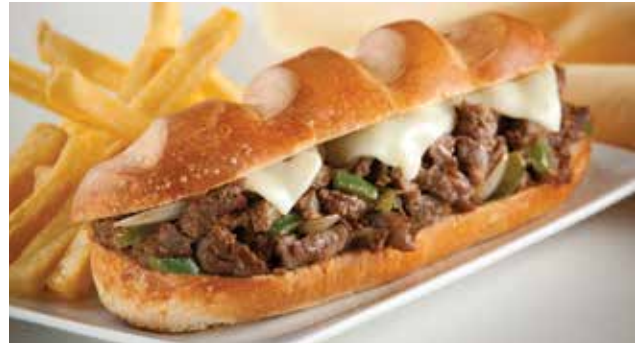
Traditional Philly Cheesesteak Sandwich

Steak-EZE Beef on thick Texas toast with grilled onion and American cheese.