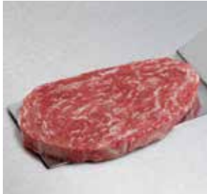
Ready to cook BreakAway

The BreakAway Steak was created and patented to provide the foodservice industry with a versatile, superior-quality, portion-controlled Philly Cheesesteak serving. Steak-EZE® BreakAway products are made from premium quality whole muscle raw materials and go from case to plate in less than three minutes.