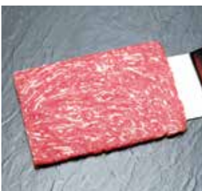
Ready-to-cook Fast BreakAway Flat Steaks