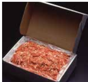
Ready to cook Steak-EZE Bulk Case

Bulk ready-to-cook Steak-EZE Flat Steaks are designed for high volume operators to thaw and to use right out of the box or bag to the grill. The bulk Flat Steak products once thawed must be cooked and used. Not designed to be refrigerated. Bulk products are not portioned controlled and need to be portioned before placing on the grill or oven.