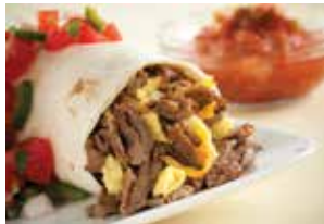
Steak Breakfast Burrito

Steak-EZE Beef on a toasted bagel with scrambled eggs and American cheese. Served with hash-brown bites and orange juice.