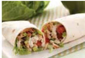
Chicken Caesar Wrap

Steak-EZE Corned Beef on dark rye bread with Swiss cheese, sauerkraut and Thousand Island dressing. Served with potato chips and a pickle spear.