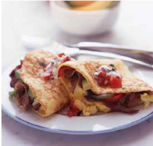
Steak and Egg Crepadilla