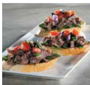
Sirloin Steak Bruschetta