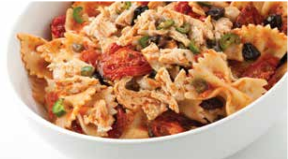
Chicken Arrabiata Farfalle

Steak-EZE Beef atop stir-fried vegetables with an Asian sauce. Served with steamed white rice.