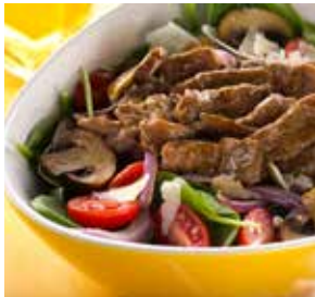
Grilled Sirloin Spinach Salad