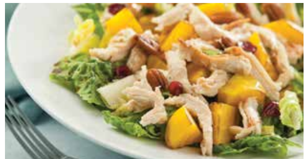
Chicken Chop Salad