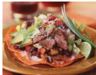
Sirloin Steak Caesar Tostada

Steak-EZE Chicken on a cornmeal-dusted roll with barbeque sauce, shredded cheddar cheese and creamy coleslaw.