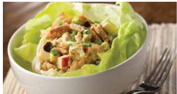
Curried Chicken Salad