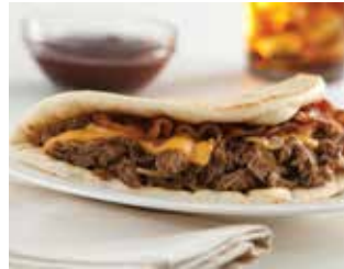
Steak Flat Bread Sandwich