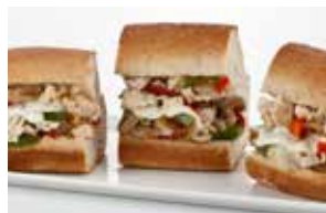
Loaded Chicken Philly Sandwich Trio