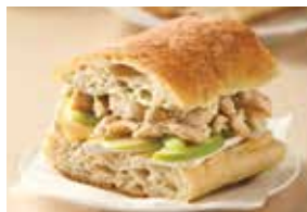
Autumn Chicken, Apple and Brie Sandwich