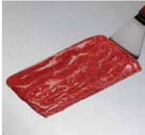
Ready-to-cook Traditional Flat Steak

What began in Philadelphia many years ago has continued into the present day. The Traditional Flat Steak is for the chef accustomed to preparing Philly Cheesesteak Sandwiches in the conventional manner, as it is done in some of the East Coast's most popular restaurants. Traditional Flat Steaks can be prepared in 90 seconds and the piece size will depend upon the grill operator.