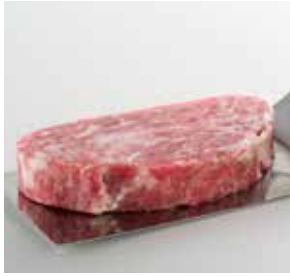
Ready-to-cook Thick Cut BreakAway