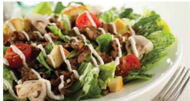
Peppercorn Steak Salad

Steak-EZE BreakAway Chicken with chopped, crisp romaine lettuce, dried cranberries, roasted golden beets, toasted spiced pecans and a honey balsamic vinaigrette.