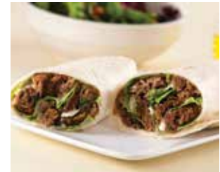
Steak Caesar Wrap