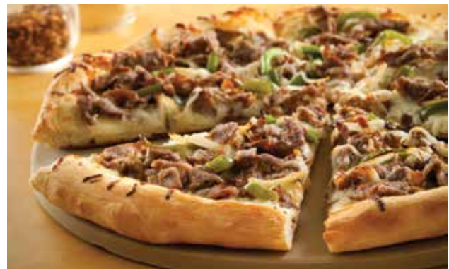
Philly Cheesesteak Pizza