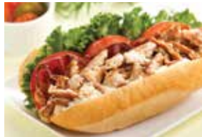
Chicken Philly Club Sandwich