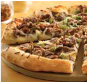
Philly Cheesesteak Pizza