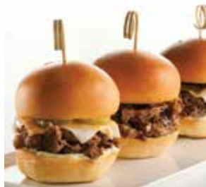
Steak Slider Trio