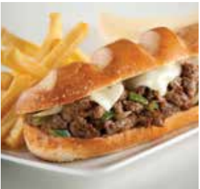
Traditional Philly Cheesesteak