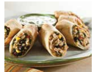
Southwestern Egg Rolls