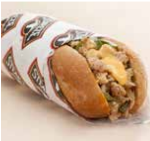
Chicken Philly Sandwich