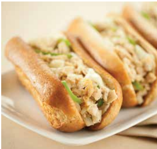
Traditional Chicken Philly Sandwich