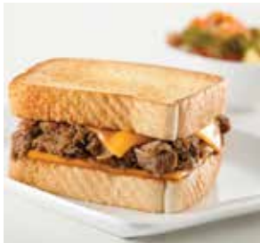
Steak Grilled Cheese