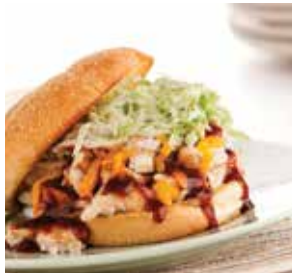
BBQ Chicken Sandwich