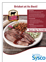
CAB® Sysco Brisket Rebate (68067)