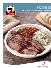
CAB® Brisket POS (21182)