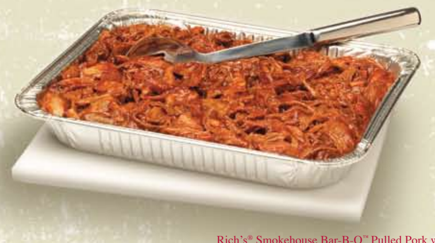
Rich's® Smokehouse Bar-B-Q™ Pulled Pork with Traditional Sauce in the convenience of a 5-lb. tray. (#09750)

Authentic bar-b-q just doesn't get any easier. We've done all the hard work—from smoking our meats up to 18 hours to selecting just the right sauces to best complement our pork, beef and chicken varieties. All you do is thaw, heat and serve. Choose our convenient 5-lb. boil-in-bag, 5-lb. disposable foil tray or 5-lb. plastic tub. We've even left some dry, so you can sauce 'em yourself.