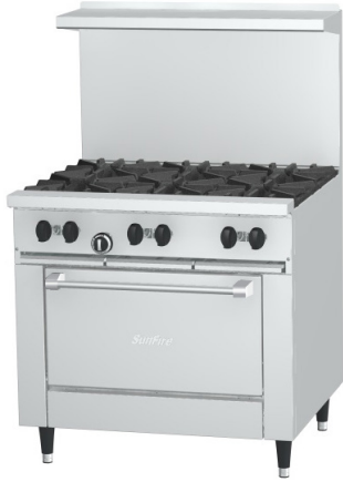
Model X36 - 6R