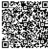
Scan to download the Delta® 5 spec sheet

Chemical Sanitizing Door-Type Glasswasher/Dishwasher ..... $8,280