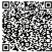
Scan to download the TempStar® spec sheet

Dishmachine with Electric Heat & Built-In Booster Heater ..... $13,773