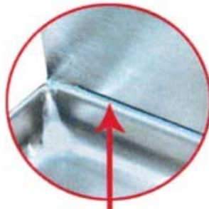
Typical silicone-filled seam design