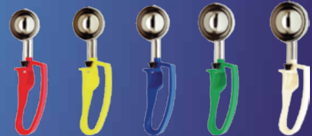
Universal EZ Disher