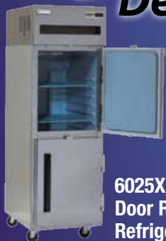
6025XL-S Solid Door Reach-In Refrigerator

BAKE THIN AND REGULAR CRUST PIZZAS FAST!