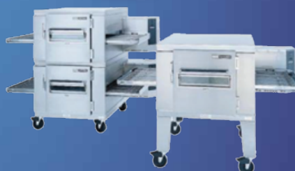
Impinger I Conveyor Pizza Oven (1400 Series)