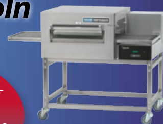
Impinger II Express (1100 Series)

STATE-OF-THE-ART POSITIVE DETENT DIGITAL CONTROLS