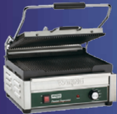
WPG250 Panini Grill