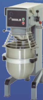
W40A Commercial Mixer