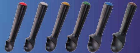
Zerolon Ice Cream Scoop