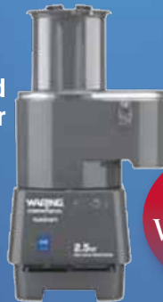
FP25C Food Processor