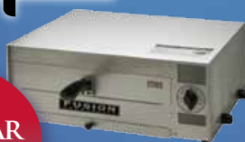
507FC Fusion 12" Pizza Oven