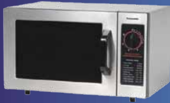
NE-1024F 1000 Watt Dial Commercial Microwave Oven