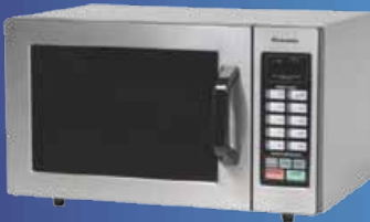
NE-1054F 1000 Watt Commercial Microwave Oven with 10 Programmable Memory