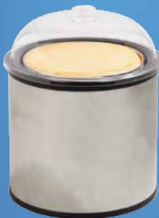
38655 – Coldmaster® Ice Cream Shroud