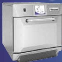
Eikon E4 Accelerated Cooking Oven