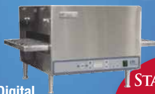
NEW Digital Countertop Impinger CTI (2500 Series)

STATE-OF-THE-ART POSITIVE DETENT DIGITAL CONTROLS