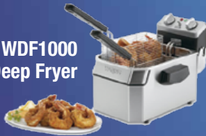
WDF1000 Deep Fryer