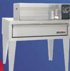
Model E56P Air Deck Electric Pizza Oven

UNIQUE AIRFLOW FOR GREATER BAKING PERFORMANCE