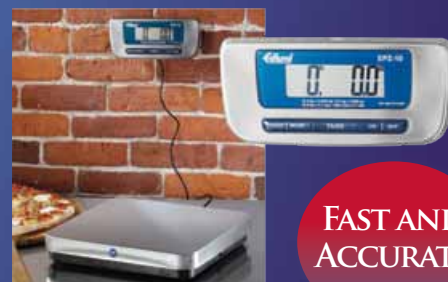
EPZ-10 Digital Pizza Scale