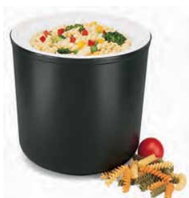
2 qt Coldmaster® Crock (CM1030) Keeps dressings, salads & condiments cold for hours; additional accessories available