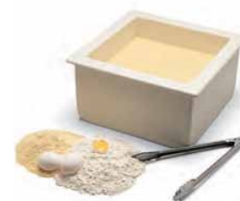
Coldmaster® Batter Pan (CM1072) Keeps batter at safe temperatures; 10 qt capacity accommodates standard size fry baskets

P 800.492.7400 F 614.899.9797 W www.zinkfsg.com