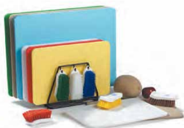
Spectrum® Cutting Boards & Accessories Color-coded boards, brushes, and other accessories help you meet HACCP guidelines