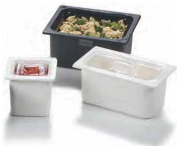
Coldmaster® Food Pans Maintains temperatures at 40° F or lower for up to 8 hours; available in a variety of sizes