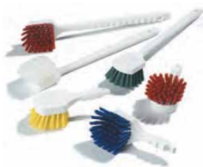
Spectrum® Kitchen Brushes Support your kitchen HACCP program with color-coded dish and pot brushes for cleaning kitchen utensils and equipment