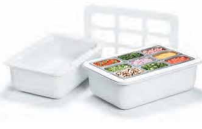
Coldmaster® Pan/Organizer (CM1049) Replaces unsafe ice baths for omelet or prep stations