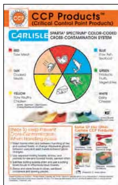
Spectrum® Wall Chart Laminated chart provides a quick reference for kitchen staff on proper use of the color-coded system