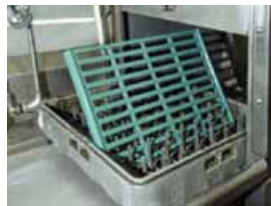
Mats lift off for easy cleaning and fit into dishwashers.