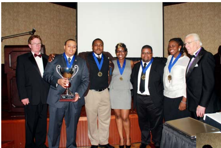
1st. PLACE WINNER University of Maryland Eastern Shore