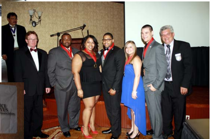
3rd. PLACE WINNER Johnson & Wales University, Charlotte