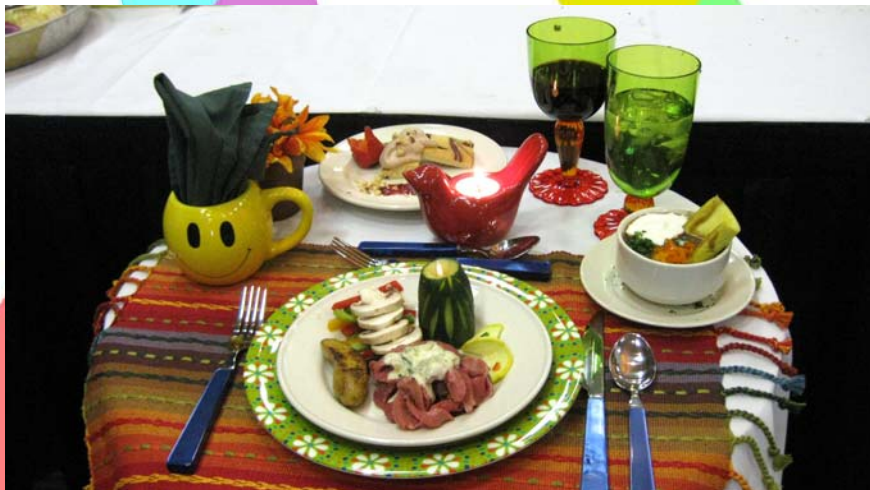
Past Chairman's Culinary Team's entry.