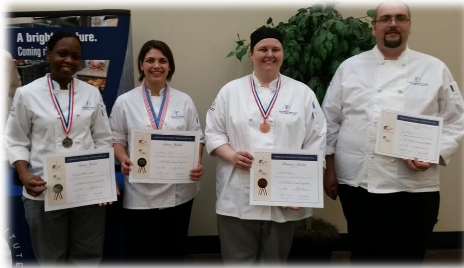
Pictured (Left to right)