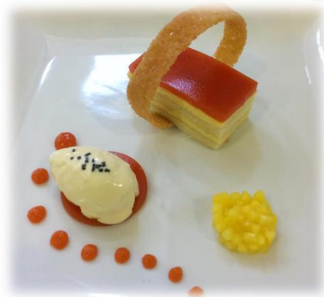
Jaime Graves Panera Bread Student Silver Medal